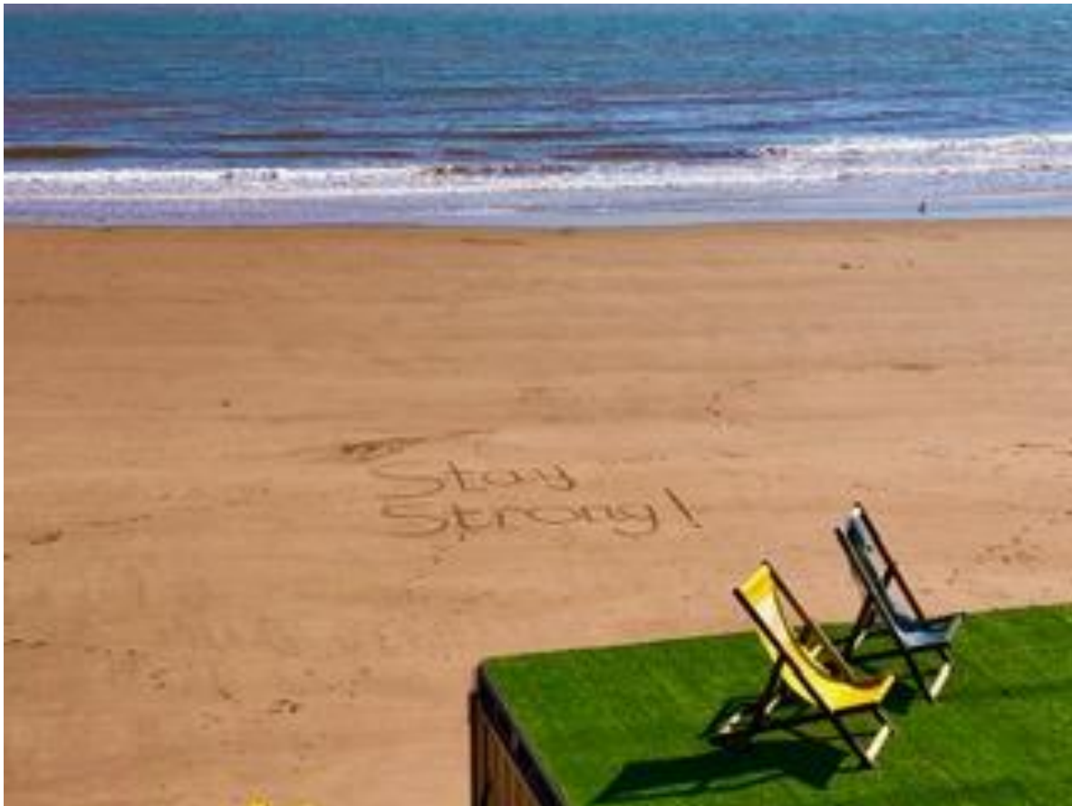
Sandy Bay beach