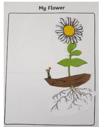
Drawn by a Yr 4 child