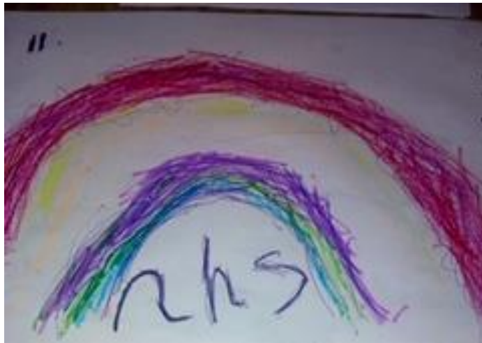
Drawn by a Yr 1 child